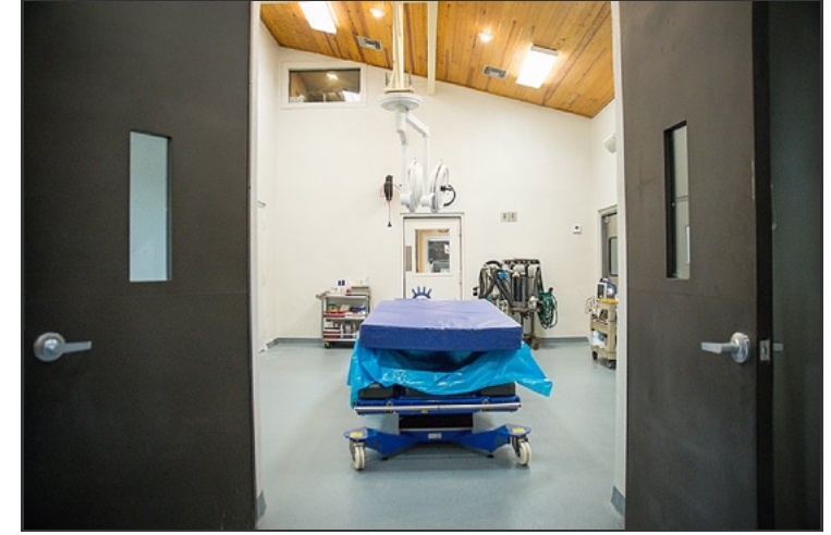
The operating room at PBEC.